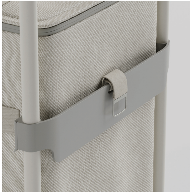
Multi-purpose rear strap Secures the basket to the chassis (and hold the cart together while undeployed)