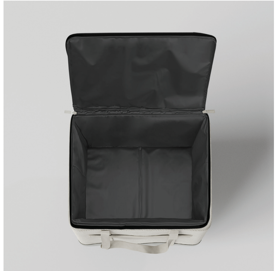
Exchangeable all-purpose padding Can be switched in for other tasks like laundry, also machine washable