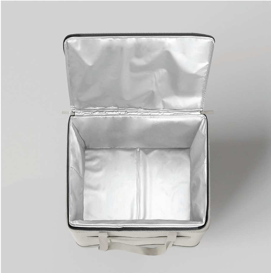
Exchangeable insulated padding Can be switched in for grocery trips and machine washable