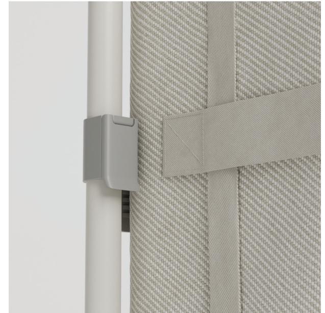
Adjustable height Release latch to adjust the handle height (similar to that of the bike seat)