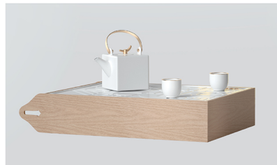
• Tea tray