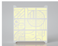
• Paper carving lamp