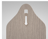
• Eaves modeling of waterside village