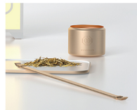
• Teaspoon(gift box handle)