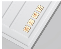
• Metal stamp

When the moon cakes and tea are taken out, the gift box itself becomes an appliance for appreciating the moon and tasting tea: The bamboo box and the ceramic cover plate form a tea tray for drainage when drinking tea; The copper handle can be used as a teaspoon to help remove the tea from the small pot; The colored translucent box inside is used as a lantern for appreciating the moon at night; The spherical structure on the cover can be removed as an incense burner to help us drive away mosquitoes and flies.