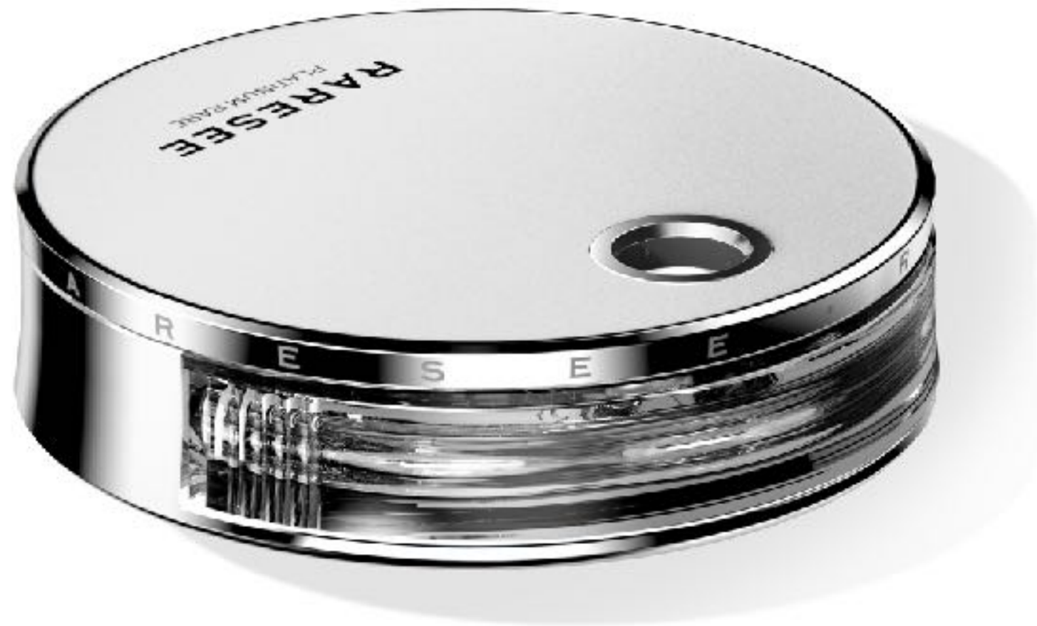
RARESEE Facial Atomization Device

Micropore-ultrasonic atomization technology can target the specific skin concern and improve skin condition.