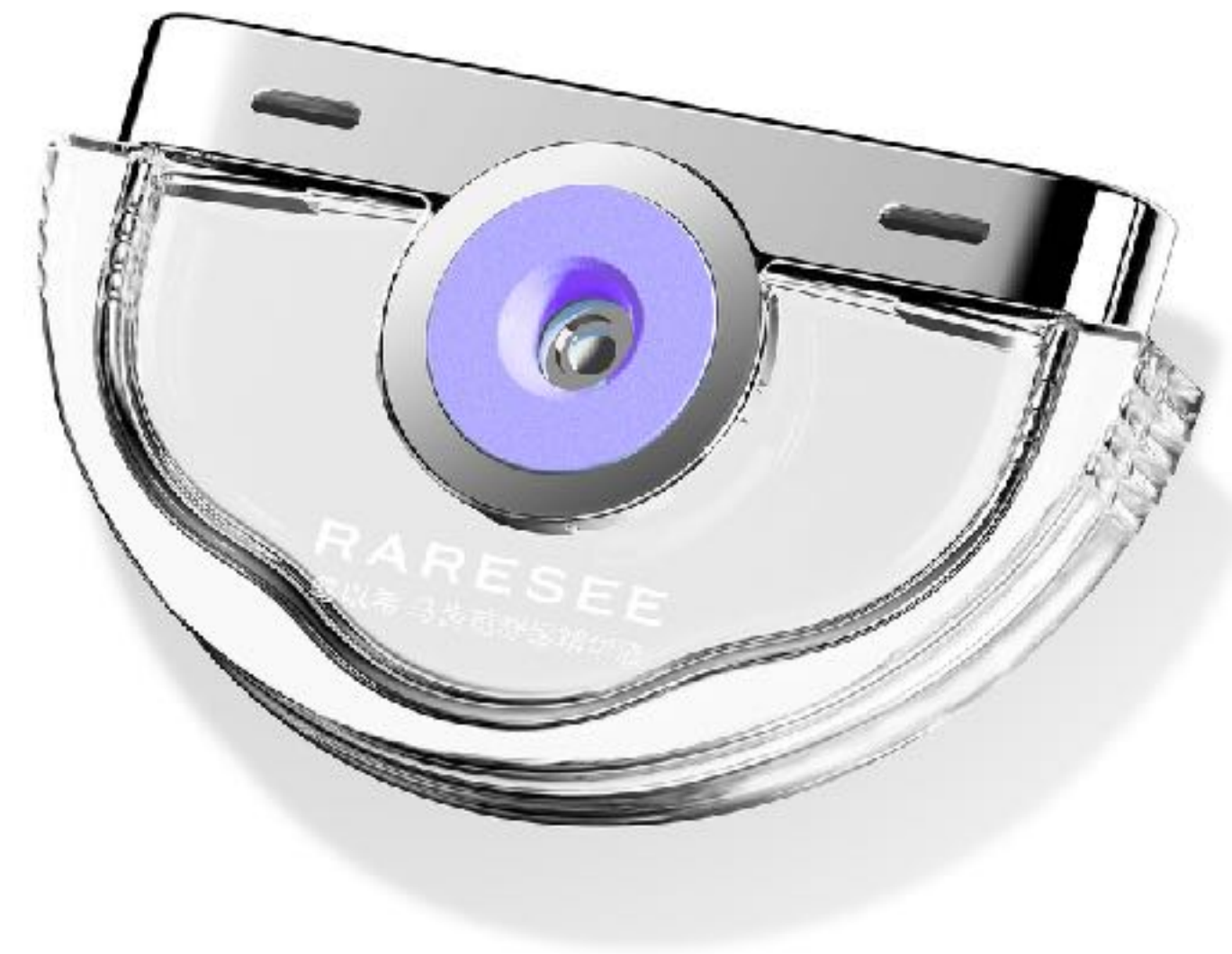
RARESEE Essence Refill