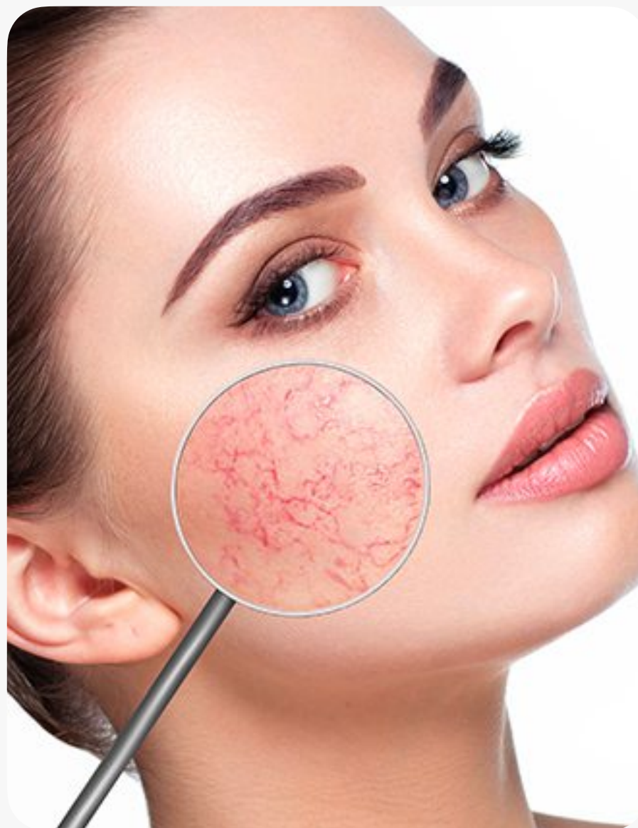
Redness and itching

Traditional facial mask cannot solve basal layer skin problems.