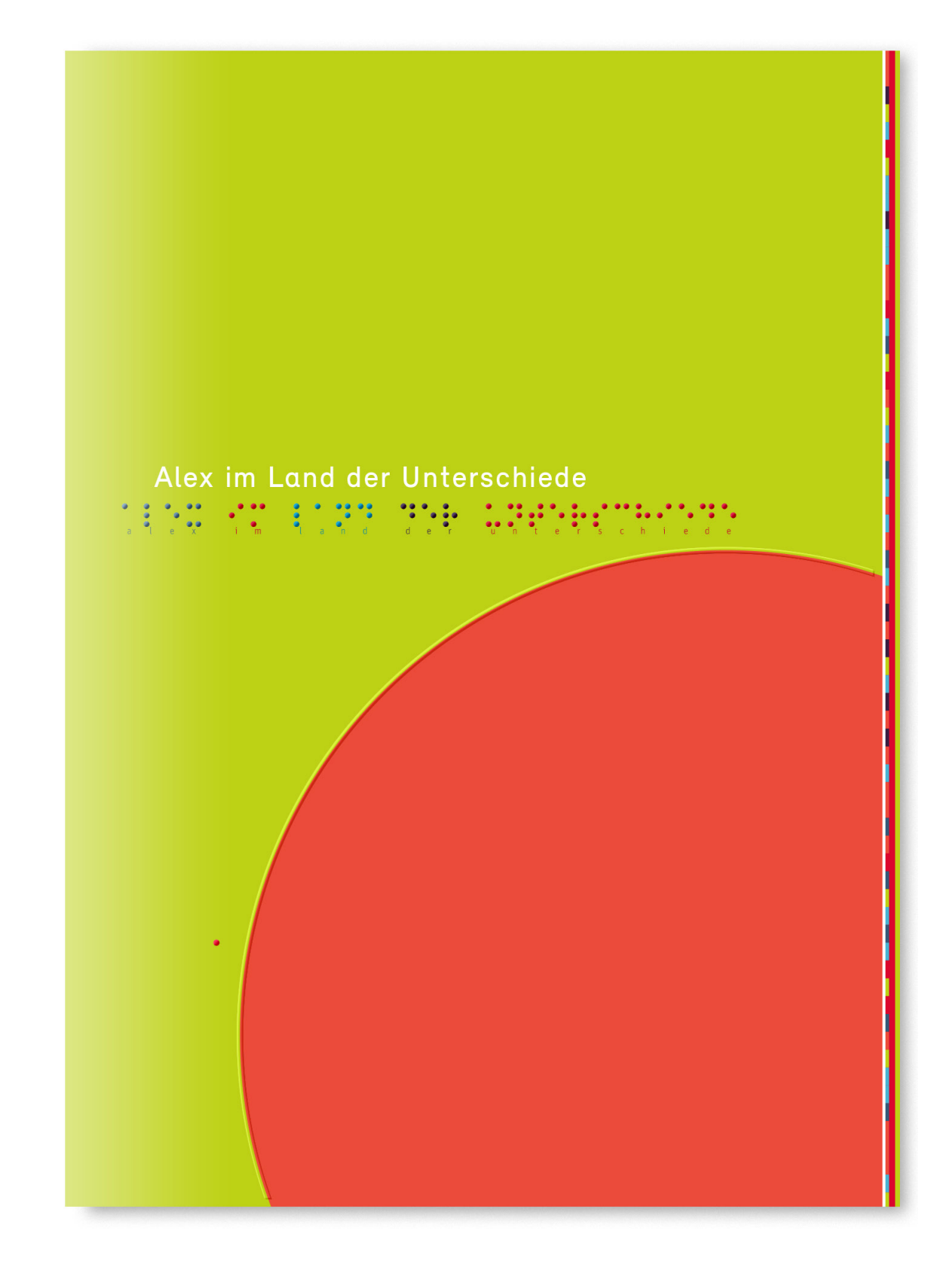
Volume 2 — Alex at the fairground — Follow lines with fingers and/or eyes; eye-hand coordination (only for sighted and visually-impaired children) Graphomotor skills (229×324 mm/24 pages)