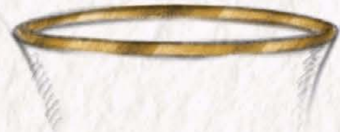
3. The Divergent Rim