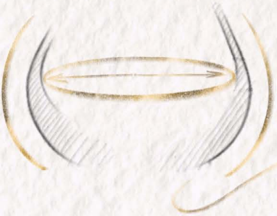
5. The Bulb