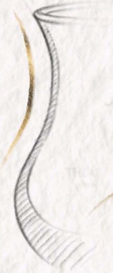
2. The Chicane