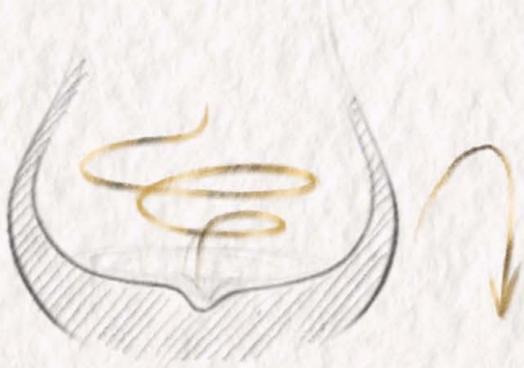
4. The Vortex Point