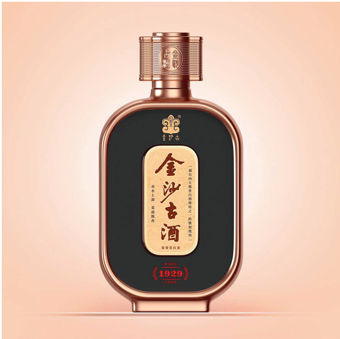
Front of Bottle