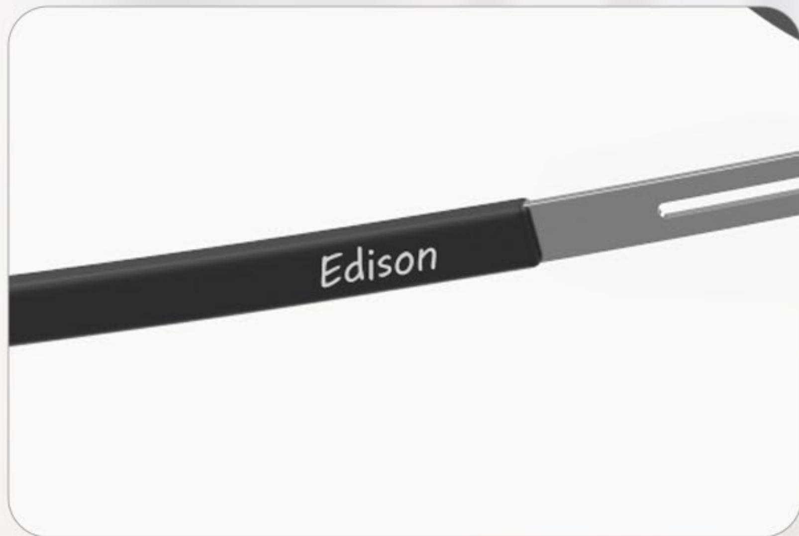
Name and pattern can be engraved on the temple

PIPIDOG's eyeglasses also offer one-to-one DIY custom graphics, allowing each pair of glasses to be customized with the child's name or pattern on the temple. This personalized customization method makes the wearing experience more interesting and unique. In addition, the integrated screwless structure also ensures that the temple is stable and not easily loosened.