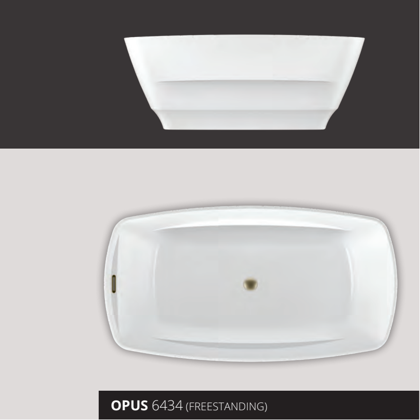
OPUS 6434 (FREESTANDING)