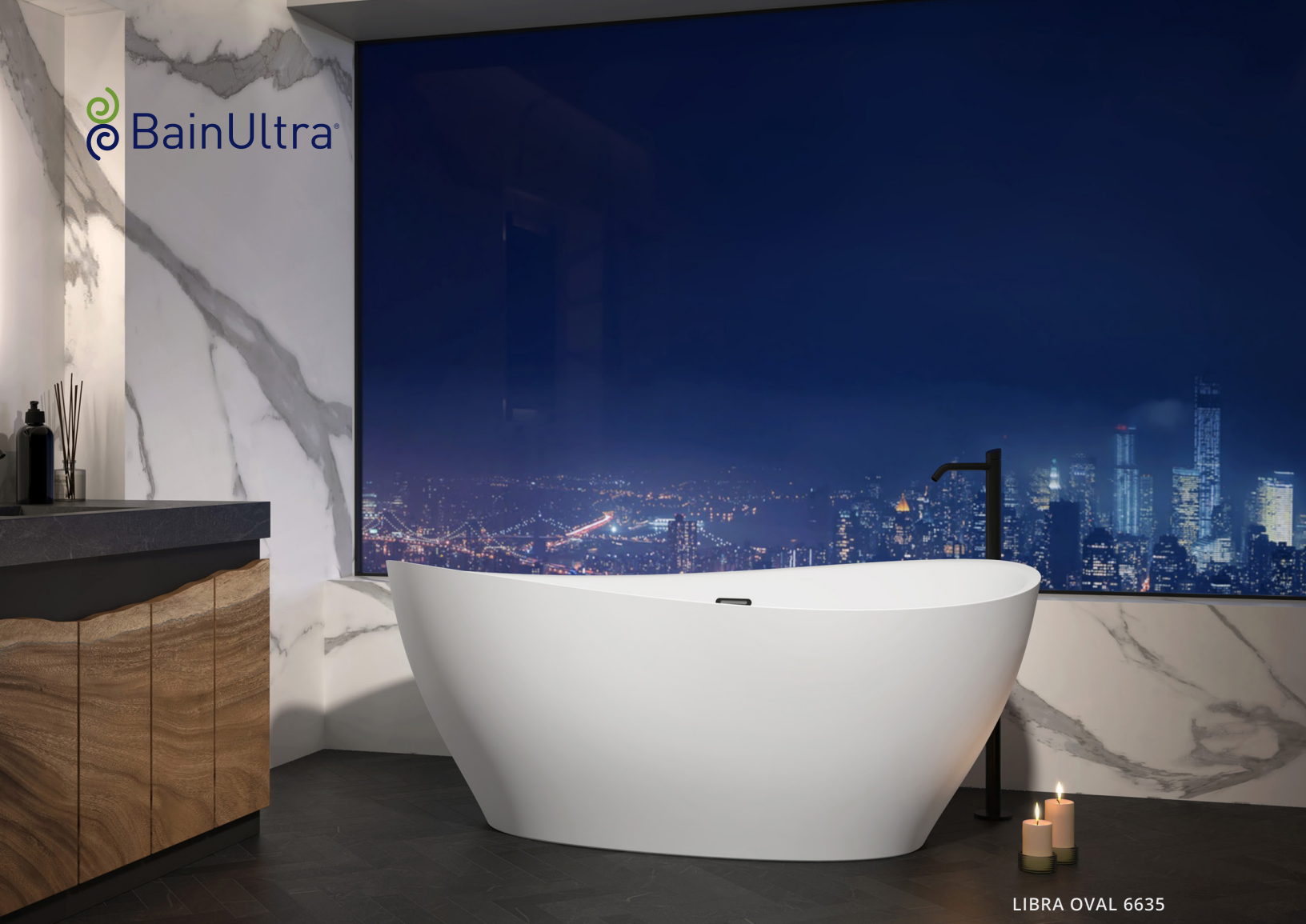
LIBRA OVAL 6635