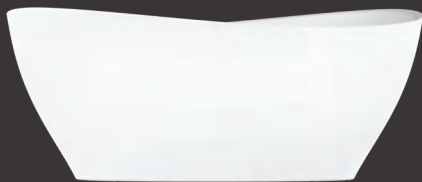
LIBRA OVAL 6635 (FREESTANDING)