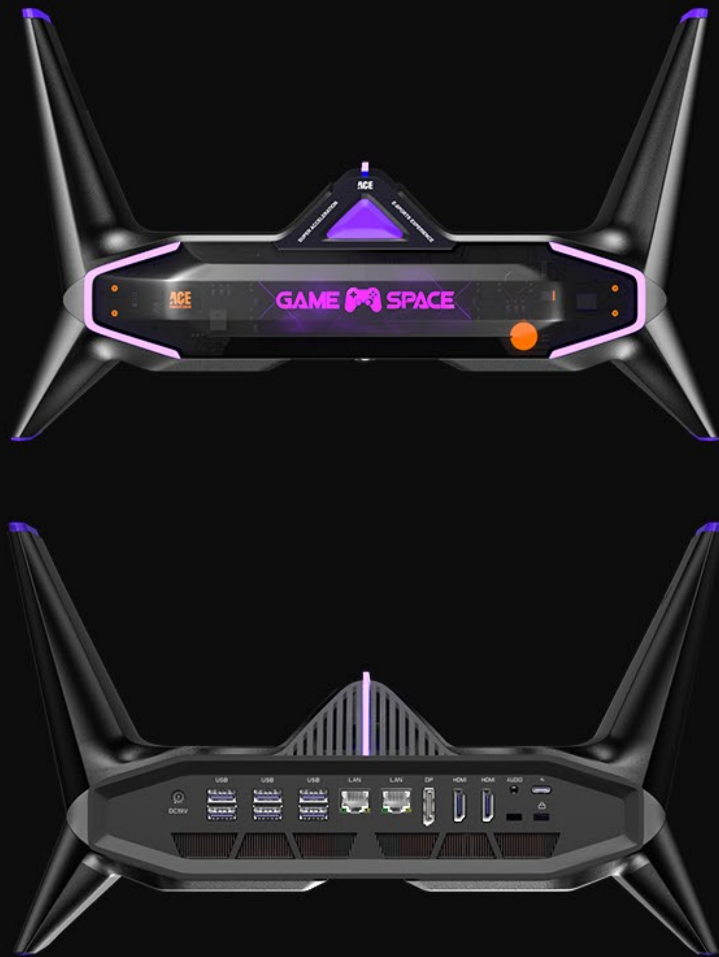
Simple and symmetrical design

This product breaks through the traditional appearance which is either square or round and adopts bionic design, perfectly integrating the shape of wings into the design and matching the perception and operating habits of users. The appearance is inspired by the shape of silver wings which is like a spaceship and is very technological, with the appearance of flying wings implying eternal dreams and pursuits. Simple, symmetrical and modern design perfectly fits the minimalist design aesthetic. The metallic paint on the exterior can reflect light, creating a shiny visual effect that makes the product more eye-catching. At the same time, the metallic paint has good durability and wear resistance and it is not easy to fade or change color, which prolongs the service life of the product. The black transparent panel and upscale shape bring unique attraction to the product.