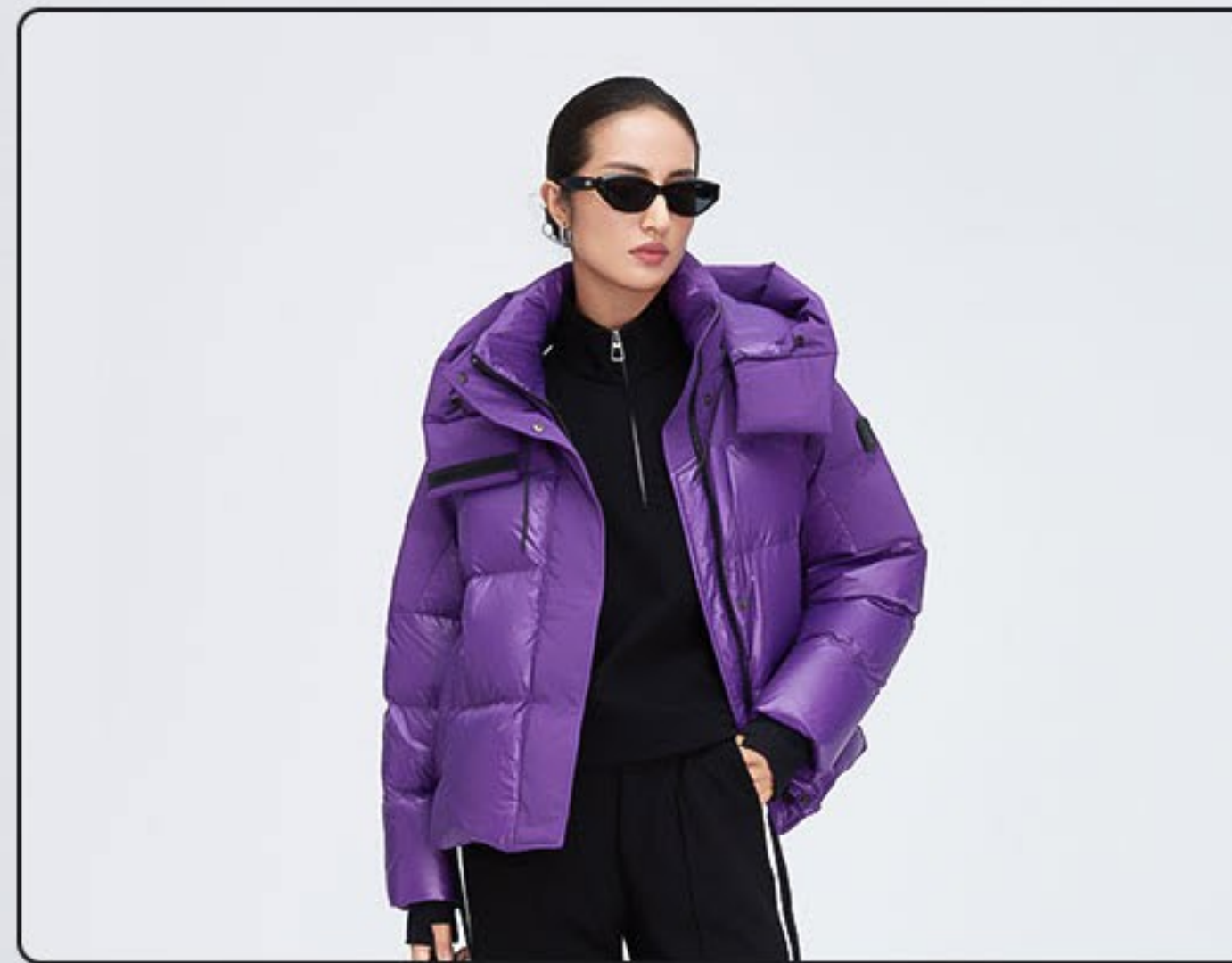
● Wisteria purple