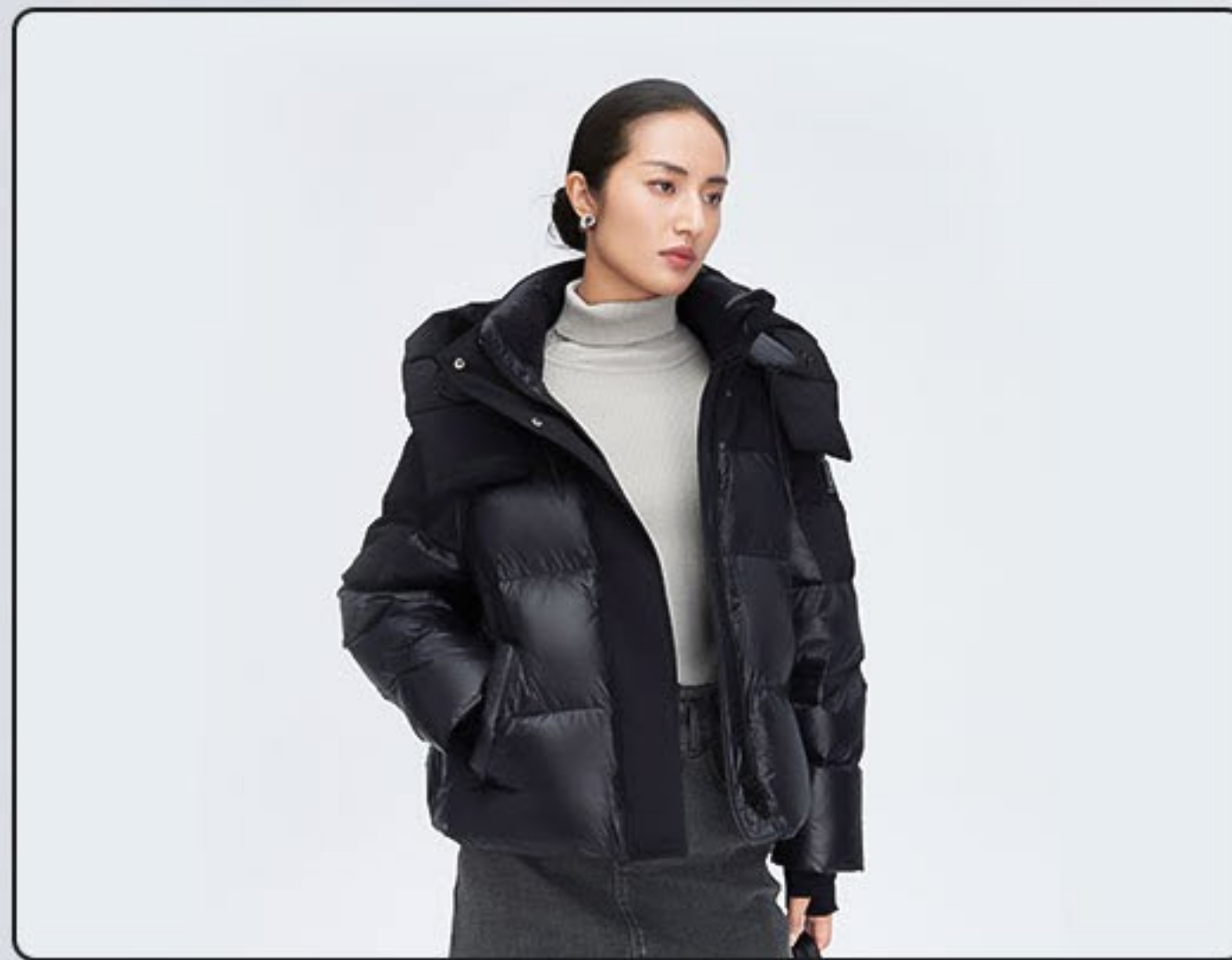
● Charcoal black

Simplicity and power are the keynotes of this series. The addition of performance fabrics not only tinctures it with a sense of technology but also gives it a hint of modernity for women.