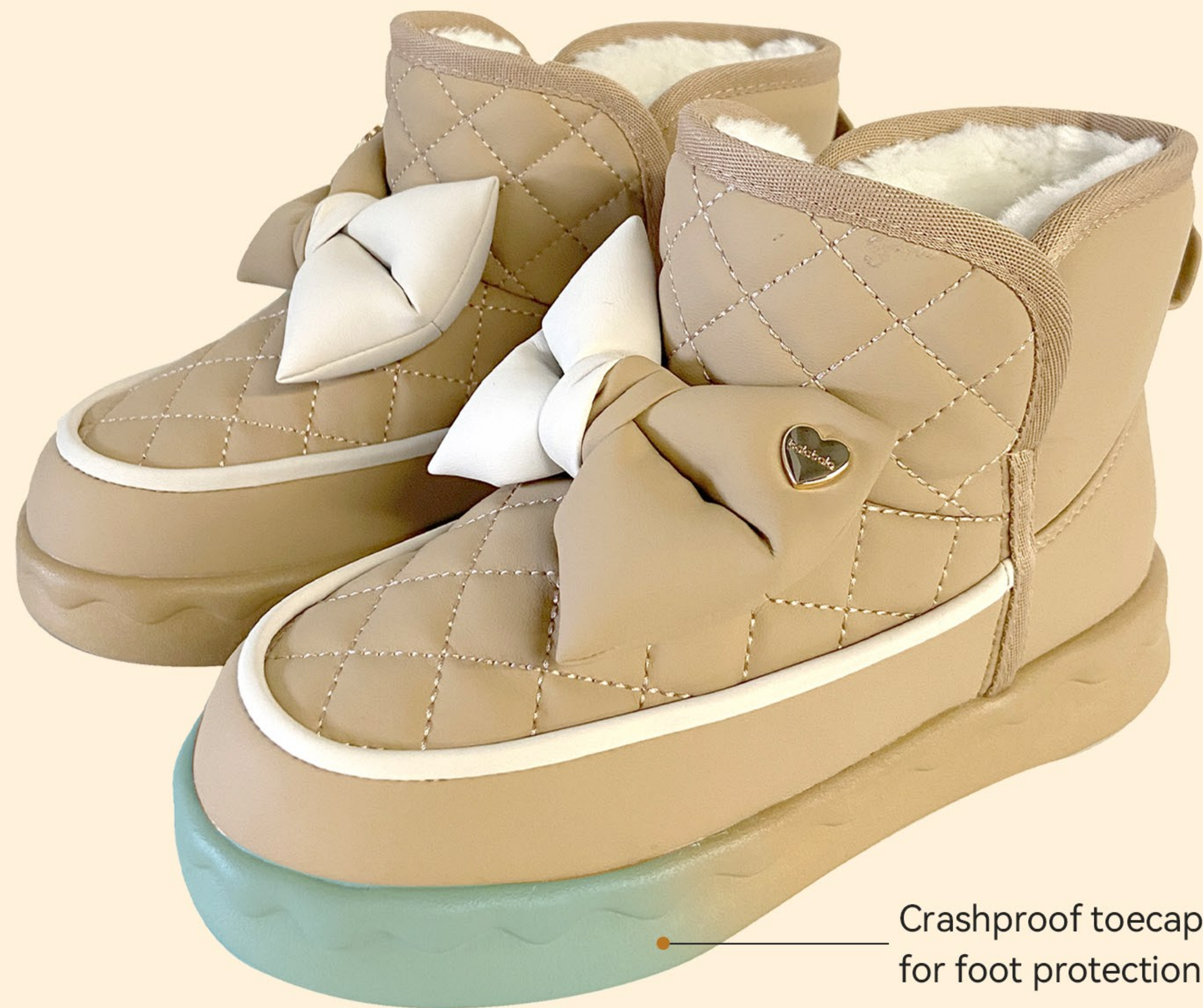
Crashproof toecap for foot protection