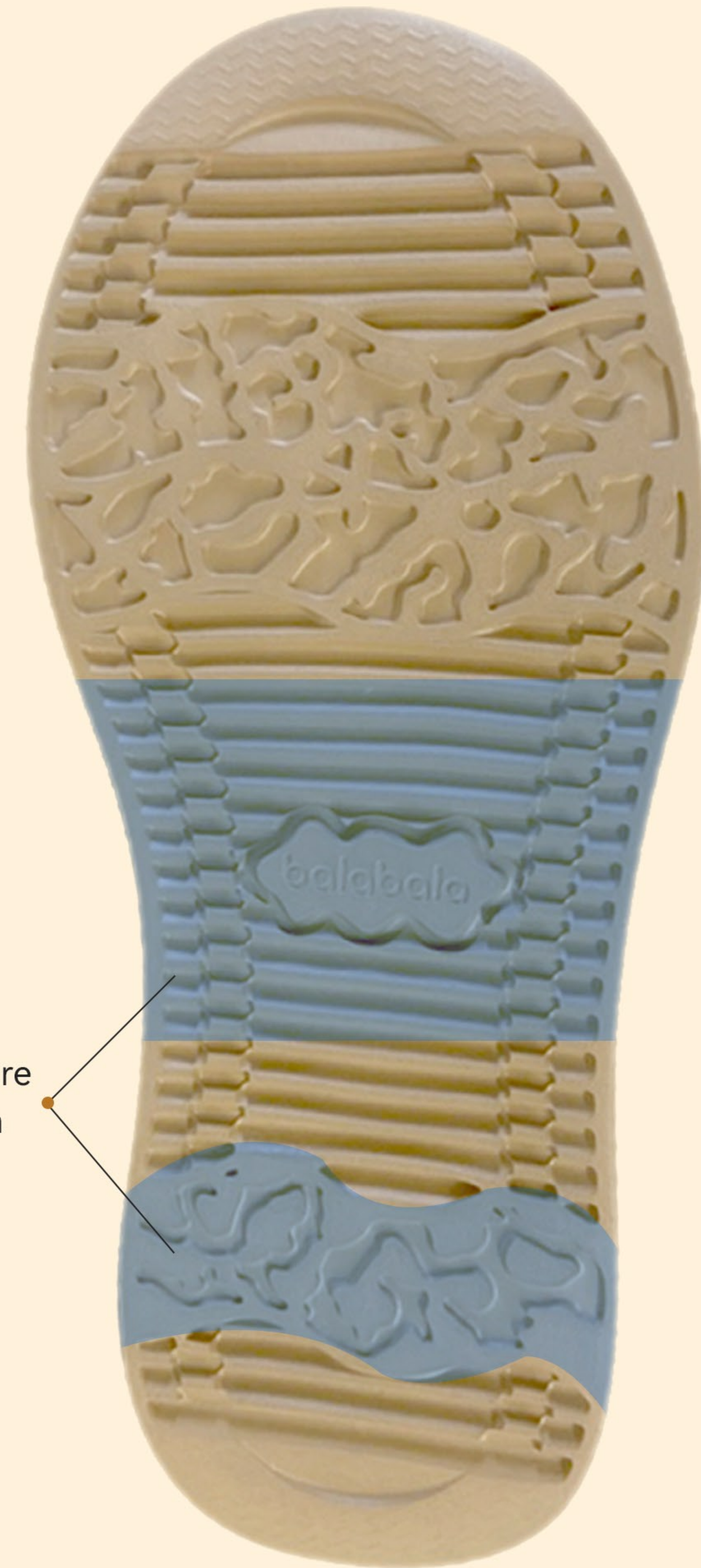
Anti-slip texture on the bottom