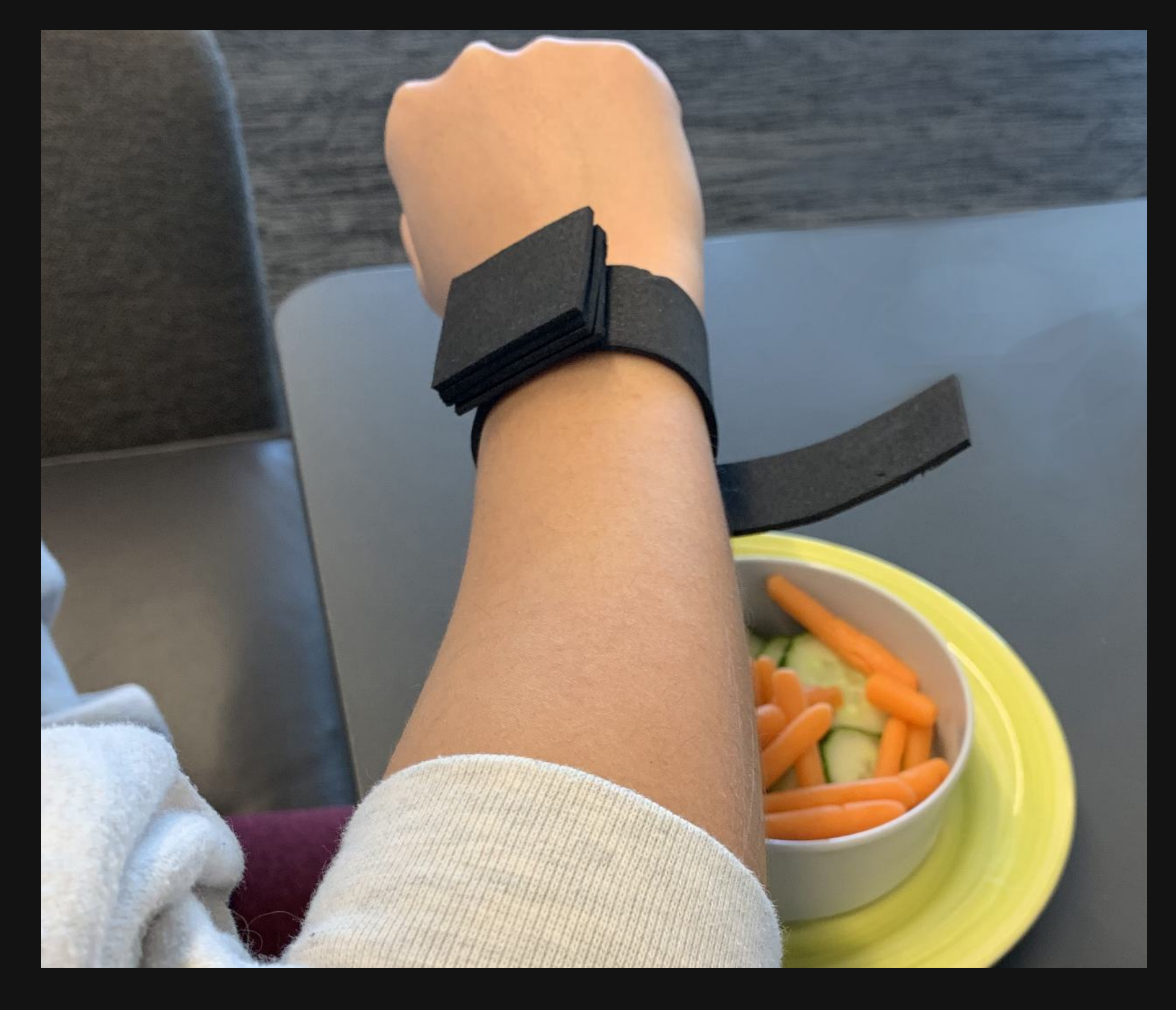
Lifting the arm, 3 out 5 preferred

3/5 users think lifting arms is the most comfortable posture, comparing to twisting their arms to take a picture.