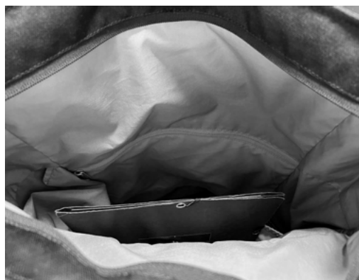
ZIPPERED POCKET FOR VALUABLES