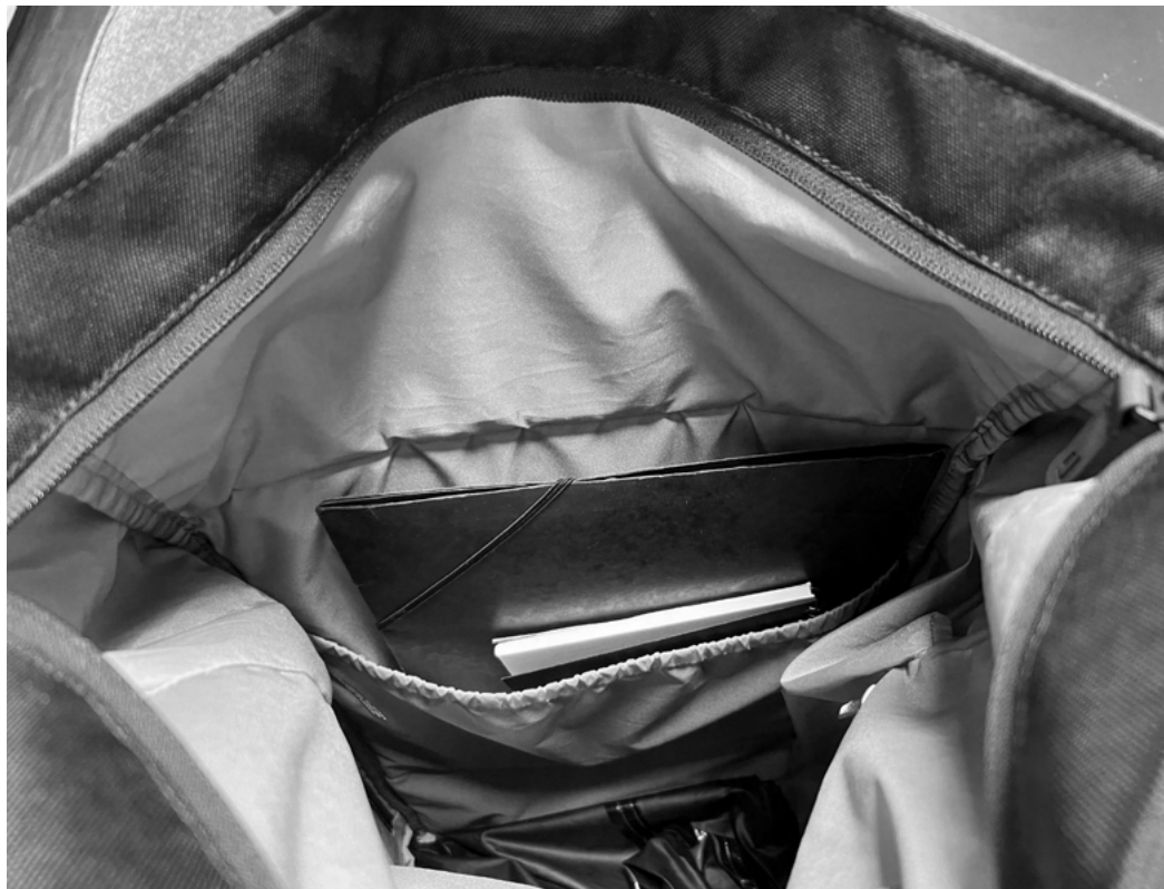
POCKET FITTING A4 AND SLIGHTLY BIGGER