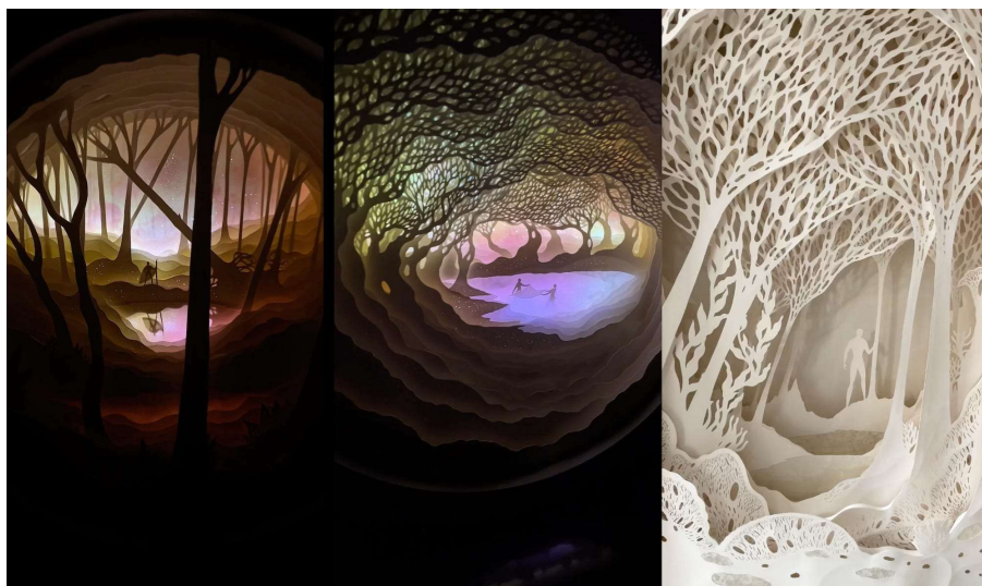
Paper Cutting Art (Hari and Deepti)

Beyond the direct inspiration of classical instruments, 'Mini Sonata' draws significant influence from the delicate art of paper cutting. The intricate laser-cutting techniques employed, coupled with the meticulous layering of components, echo the intricate beauty and dimensionality found in traditional paper cut artworks.