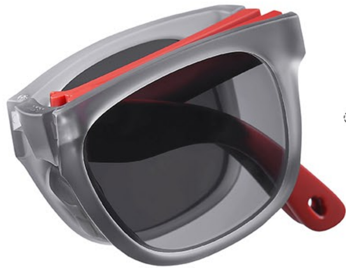
• Triple-Hinge Folding Mechanism

Kocotree Foldable Aviator Sunglasses feature a temple-frame linkage structure for a triple-hinge folding mechanism. Moreover, the versatile storage case with anti-loss straps offers handheld use or strap-on convenience. This solves the common problems of traditional children's sunglasses being easily lost or inconvenient to carry, making travel hassle-free.