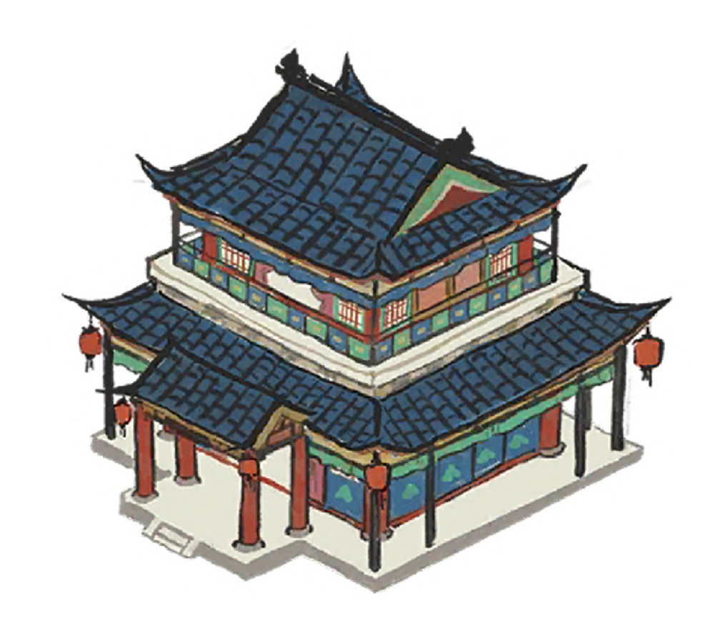
杭州楼外楼 Hangzhou Louwailou Inn

Children begin to see structure, story, and history not as separate—but as part of how the culture is built.