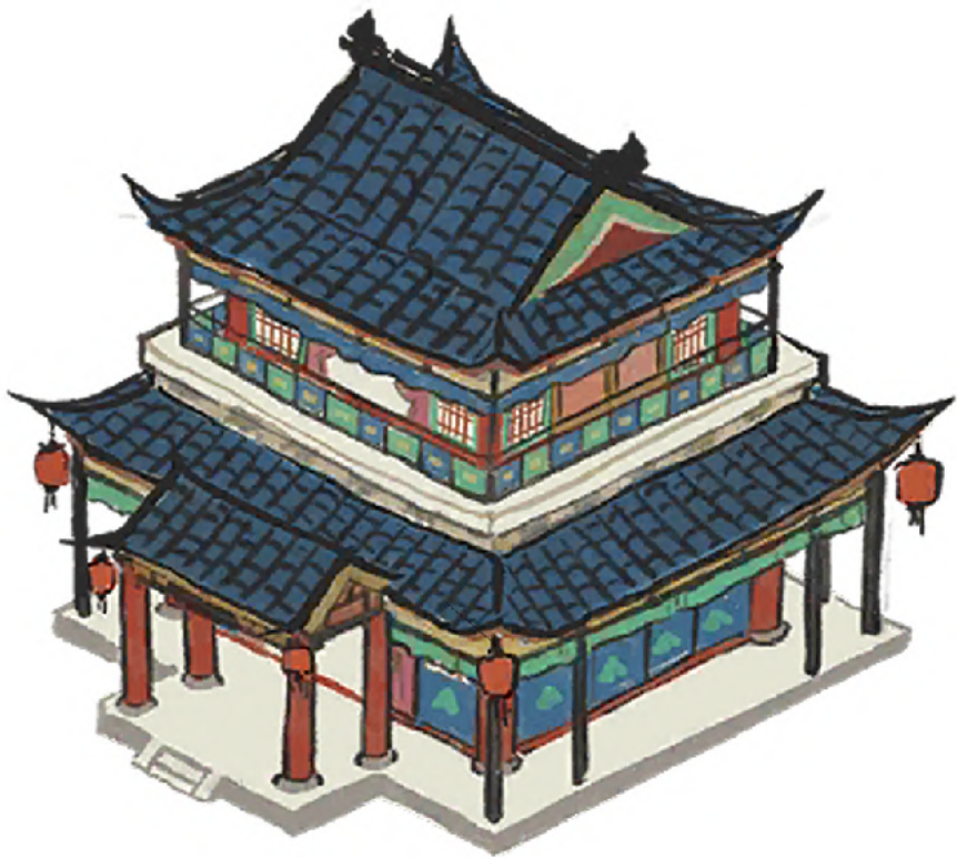
杭州楼外楼 Hangzhou Louwailou Inn