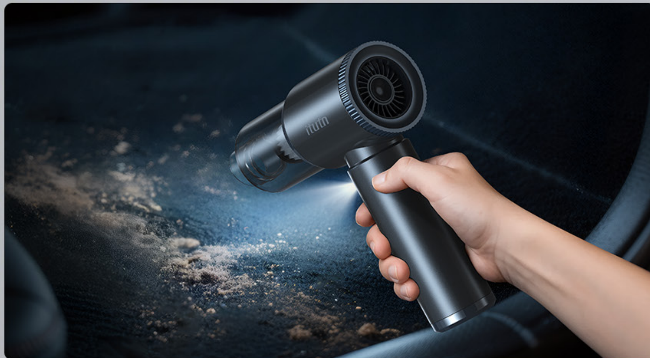
Ultra-Lightweight, Precision Control

From an ergonomic perspective, this product weighs only 370g, making one-handed operation effortless. The ergonomically designed grip enhances stability and prevents operational errors caused by fatigue. An independent light at the front allows for precise cleaning in low-light environments. Red and green indicator lights clearly show different power levels, making operation intuitive and straightforward, further enhancing user interaction.