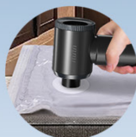
Draw air out