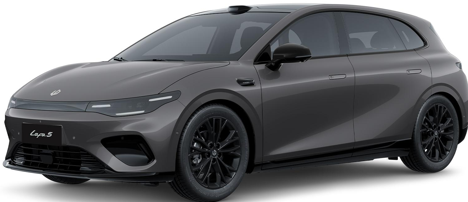
● Metallic Black

Within the constraints of an A-segment size, the Lafa5 achieves a perfect balance between posture and space through millimeter-level proportional adjustments. By meticulously adjusting the C-point, we balanced interior space with the car's diving stance. Simultaneously, the C-pillar quarter window was slightly elongated to optimize the glass area, making the cabin feel airy and comfortable. Thoughtful details are provided, such as a 320L trunk with a power liftgate, a sunroof with a physical sunshade, and a dedicated rear-seat tissue box, ensuring that every daily action of the user is considered. The seats feature a class-leading contact area of 2520cm 2 , combined with an ergonomic backrest design to deliver both long-distance comfort and a secure, enveloped feeling. Furthermore, the overall user interface of the Lafa5 follows the "Dynamic Geometry" logic, making the function layout self-explanatory and the operation naturally intuitive. This provides users with a doubly joyful experience, both visually and operationally.