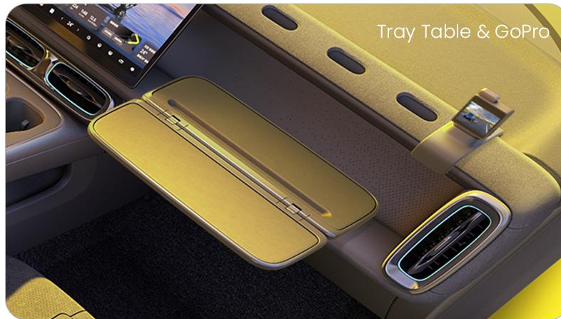
Tray Table & GoPro