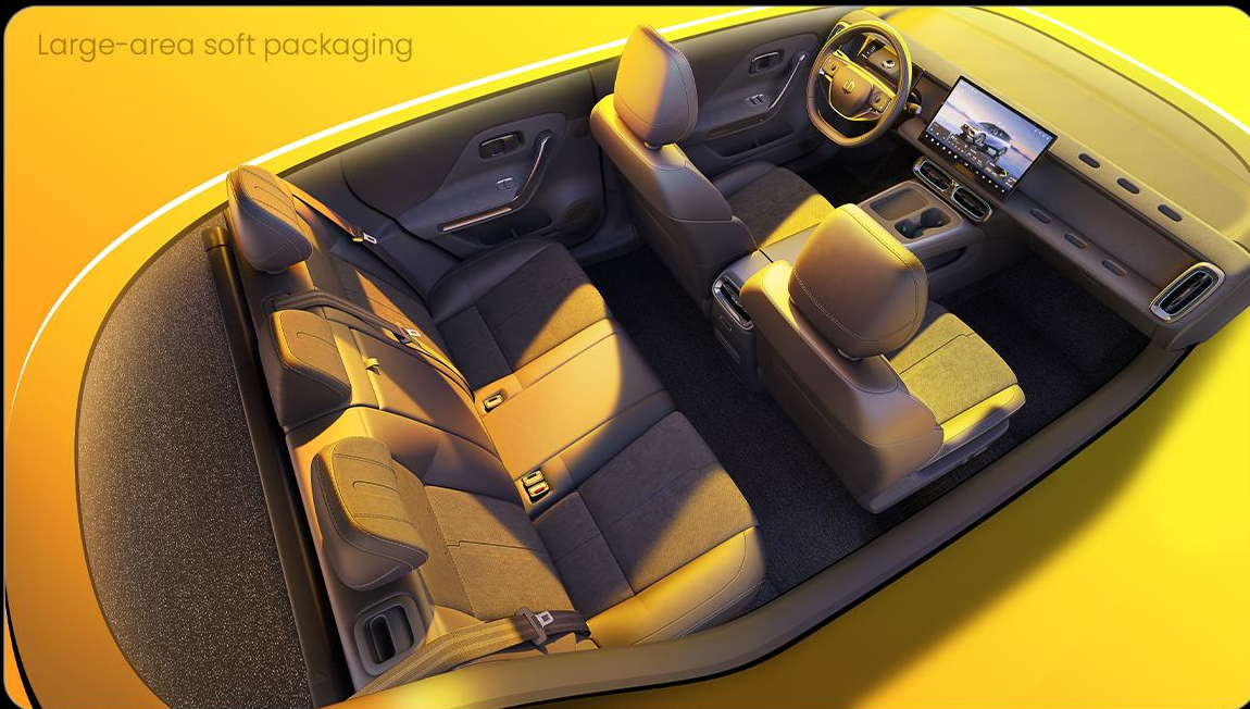
Large-area soft packaging