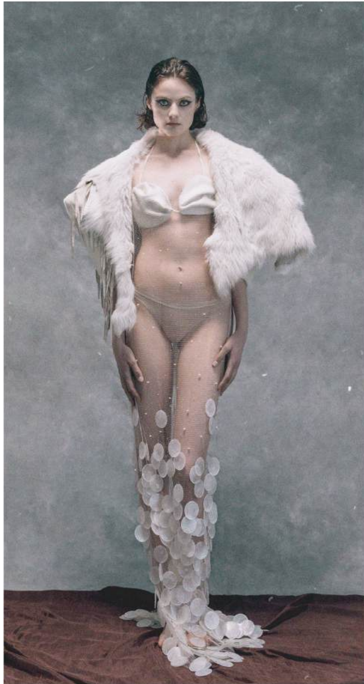
Look.5 knitted fish wire with oyster shell Capiz and natural gem stones, damaged calf hair cape with shearling collar, embroidered with sequin cut from mother of pearl, salmon skin and upcycled plastic