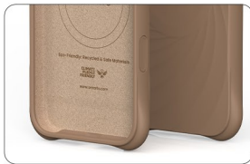
Dual-layer protective structure

The outer shell features a dual-layer protective structure of high-quality liquid silicone and a microfiber lining, offering a smooth touch, stain resistance, and wear resistance. The series is fully compatible with the MagSafe magnetic system, enabling seamless charging and multi-accessory use, maintaining both efficiency and aesthetic appeal. The earphone protective case and silicone stand follow the same design language, featuring an LED visible window, anti-slip upper cover, and impact-resistant structure, providing users with a stable and convenient experience that demonstrates deep collaboration between design and engineering.