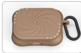
LED visible window Anti-slip upper cover Impact-resistant structure