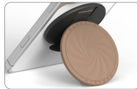
Silicone phone stand Supported either horizontally or vertically